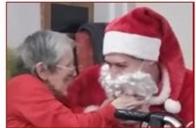
Father Christmas visits