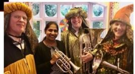
Barnarts Trio entertains