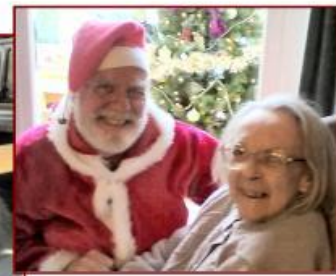
Father Christmas visits