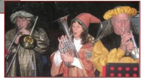
Barnarts Trio entertains