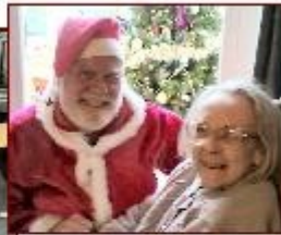
Father Christmas visits