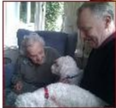
Simon of Motivation and Co