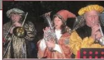
Barnarts Trio entertains