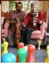
Robin at skittles